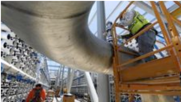
A pipe fitter installs a pressure relief valve on a pipe that will carry desalinated water from the Poseidon Water plant in Carlsbad.