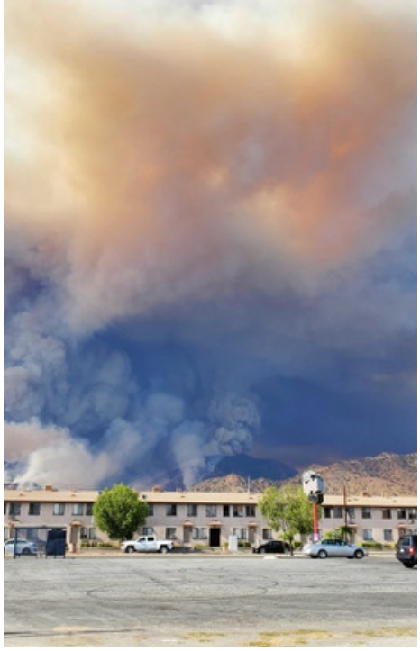
SUMMER 2020 FIRE NEAR LA.

LADWP is moving towards its goal of having a carbon free electrical supply through developing additional generation from renewable resources and power storage facilities. However, it is crucial that it maintain a prudent, on-demand, level of peaking generation to provide reliable service to its customers at times like this summer of 2020.