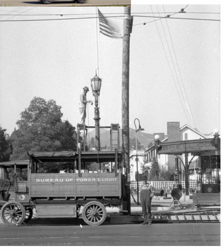
Bureau of Power and Light Electric Truck 1920s

os Angeles, known as the car capital of the world, has a long history with the electric vehicle. In the early 1920s the Bureau of Power and Light used electric trucks to assist with streetlight maintenance. As the automobile became the primary transportation mode and as population boomed in the 20th century, Los Angeles also became infamous for its unhealthy and poor air quality. The air quality in the Los Angeles basin has improved significantly over the past few decades, but is still some of the worst in the nation, again primarily due to the gasoline powered automobile. Air quality improvement is one of the key drivers in the redevelopment of the electric vehicle. In the early 1970s, LADWP formed an Electric Car Committee that worked with local universities to study the possibilities for development of an electric car and also purchased a Mars II Electrauto to demonstrate the viability of EVs throughout the city.