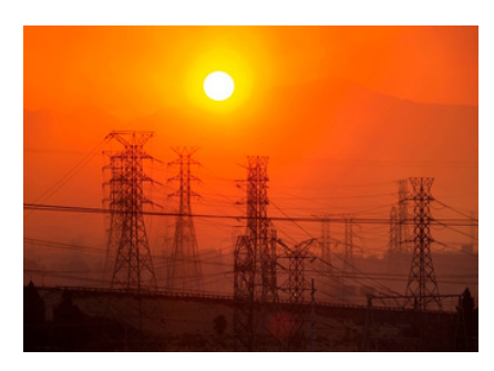
HEAT FIRE STORMS OF AUGUST AND SEPTEMBER 2020 NEAR LOS ANGELES

California's electric utility grid has been stressed to its limit during the unprecedented heat storms of August and September 2020. These heat events were recordsetting and tested the stability of the grid, both in terms of electrical equipment and resource adequacy. These events also begged the question of